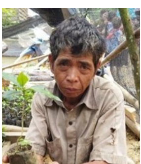
Population: 2,500 World Popl: 2,500 Total Countries: 1

People Cluster: Mon-Khmer Main Language: Katu, Western Main Religion: Ethnic Religions