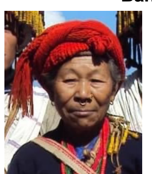
World Popl: 3,100 Total Countries: 1