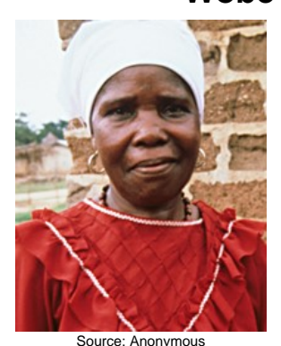
Population: 346,000 World Popl: 346,000 Total Countries: 1 People Cluster: Kru

Main Language: We Northern Main Religion: Ethnic Religions Status: Partially reached