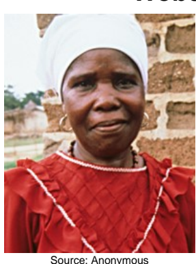
Population: 346,000 World Popl: 346,000 Total Countries: 1 People Cluster: Kru

Main Language: We Northern Main Religion: Ethnic Religions Status: Partially reached