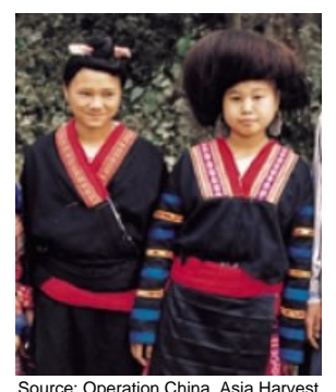
Population: 324,000 World Popl: 324,000 Total Countries: 1

People Cluster: Miao / Hmong Main Language: Hmong Daw Main Religion: Ethnic Religions Status: • Unreached Evangelicals: 0.20%