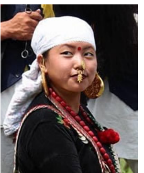
Total Countries: 2 People Cluster: South Asia Hindu - other