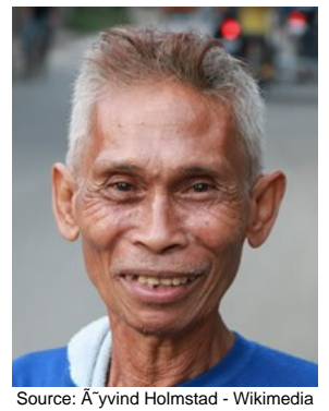
Population: 21,000 World Popl: 24,011,900