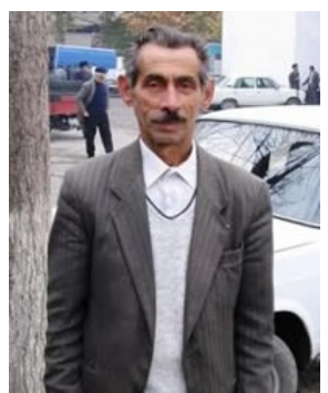
Population: 200 World Popl: 12,800 Total Countries: 6 People Cluster: Caucasus Main Language: Udi

Main Religion: Christianity Status: Superficially reached