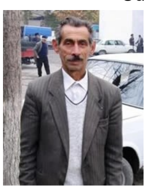
Population: 200 World Popl: 12,800 Total Countries: 6 People Cluster: Caucasus