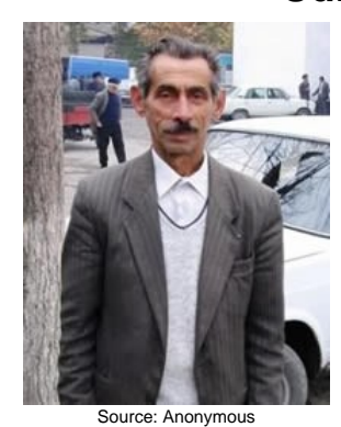
Population: 200 World Popl: 12,800 Total Countries: 6 People Cluster: Caucasus

Main Language: Udi Main Religion: Christianity