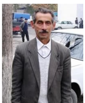
Population: 200 World Popl: 12,800 Total Countries: 6

People Cluster: Caucasus Main Language: Udi