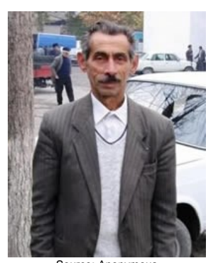
Population: 200 World Popl: 12,800 Total Countries: 6 People Cluster: Caucasus

Main Language: Udi Main Religion: Christianity