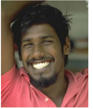
Population: 11,000 World Popl: 11,000 Total Countries: 1

People Cluster: Afro-American, Northern Main Language: Trinidadian English Creol