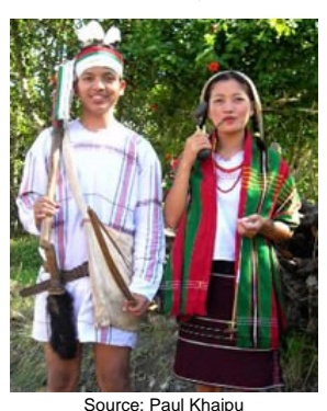
Population: 260,000 World Popl: 260,000 Total Countries: 1