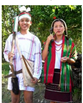
Population: 260,000 World Popl: 260,000 Total Countries: 1

People Cluster: Kuki-Chin-Mizo (Zo) Main Language: Chin, Tedim