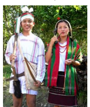
Population: 260,000 World Popl: 260,000