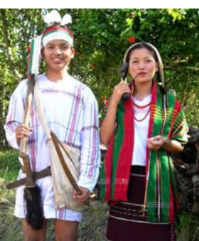
Population: 260,000 World Popl: 260,000 Total Countries: 1

People Cluster: Kuki-Chin-Mizo (Zo) Main Language: Chin, Tedim