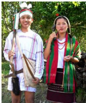
Population: 260,000 World Popl: 260,000