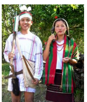
Population: 260,000 World Popl: 260,000 Total Countries: 1