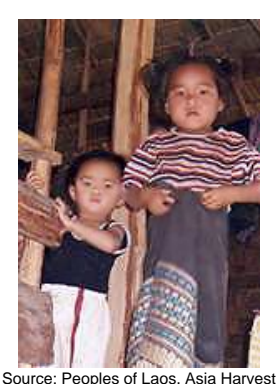
Population: 700 World Popl: 700 Total Countries: 1

People Cluster: Southeast Asian, other Main Language: Language unknown Main Religion: Ethnic Religions