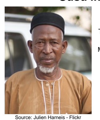
Population: 6,400 World Popl: 2,857,600 Total Countries: 5 People Cluster: Susu Main Language: Susu Main Religion: Islam