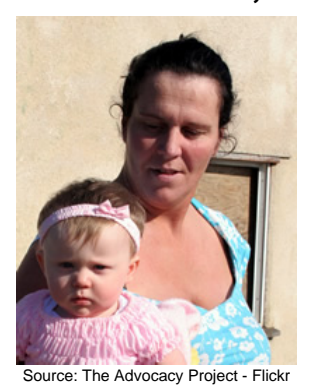
Population: 17,000 World Popl: 52,300 Total Countries: 3 People Cluster: Romani Main Language: Shelta Main Religion: Christianity Status: Partially reached

Evangelicals: 4.0% Chr Adherents: 65.0% Scripture: Unspecified