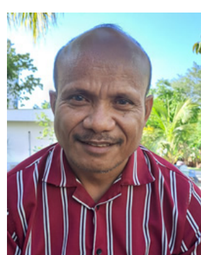
Population: 129,000 World Popl: 129,000 Total Countries: 1 People Cluster: Timor Main Language: Makasae Main Religion: Christianity