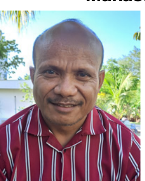
World Popl: 129,000 Total Countries: 1 People Cluster: Timor Main Language: Makasae Main Religion: Christianity