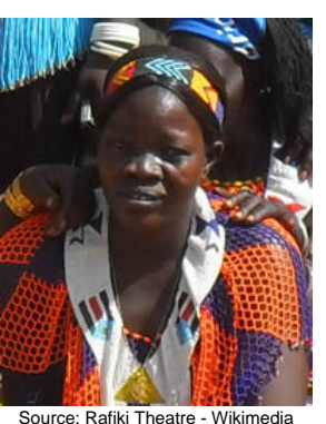
Population: 397,000 World Popl: 432,500 Total Countries: 3 People Cluster: Sudanic Main Language: Ma'di Main Religion: Christianity