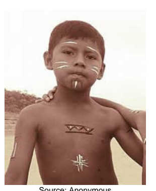
Population: 500 World Popl: 40,500 Total Countries: 3

People Cluster: South American Indigenous