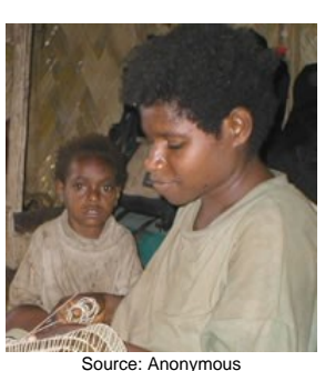
Population: 1,600 World Popl: 1,600 Total Countries: 1 People Cluster: New Guinea

Main Language: Nukna Main Religion: Christianity