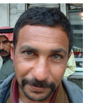
Main Religion: Islam Status: Unreached Evangelicals: 0.60% Chr Adherents: 1.00%