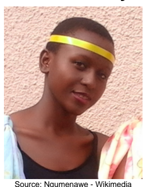
Population: 16,000 World Popl: 5,000,000