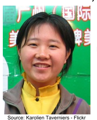
Population: 14,000 World Popl: 79,429,200 Total Countries: 36 People Cluster: Chinese Main Language: Chinese, Yue Main Religion: Non-Religious Status: Partially reached