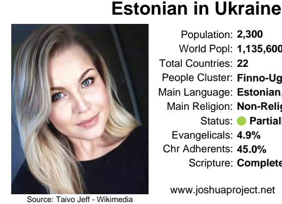
Population: 2,300 World Popl: 1,135,600 Total Countries: 22

People Cluster: Finno-Ugric Main Language: Estonian, Standard