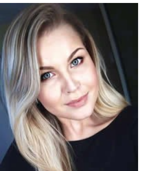
World Popl: 1,135,600 Total Countries: 22

People Cluster: Finno-Ugric Main Language: Estonian, Standard Main Religion: Non-Religious Status: Partially reached