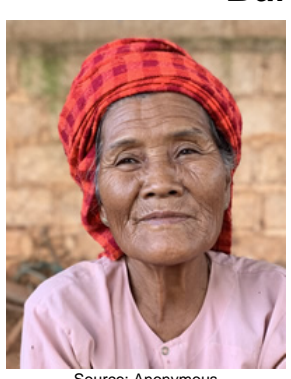
Population: 26,000 World Popl: 31,102,100 Total Countries: 20 People Cluster: Burmese Main Language: Burmese Main Religion: Buddhism