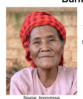
Population: 26,000 World Popl: 31,102,100 Total Countries: 20 People Cluster: Burmese Main Language: Burmese Main Religion: Buddhism