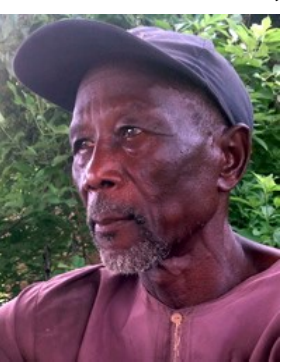
Population: 579,000 World Popl: 579,000 Total Countries: 1 People Cluster: Benue Main Language: Bura-Pabir Main Religion: Ethnic Religions Status: Partially reached