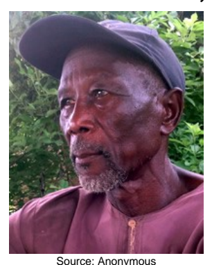
Population: 579,000 World Popl: 579,000 Total Countries: 1 People Cluster: Benue Main Language: Bura-Pabir Main Religion: Ethnic Religions Status: Partially reached