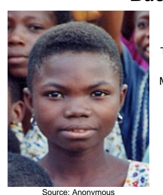
Population: 87,000 World Popl: 96,900 Total Countries: 2 People Cluster: Guinean Main Language: Lelemi Main Religion: Christianity