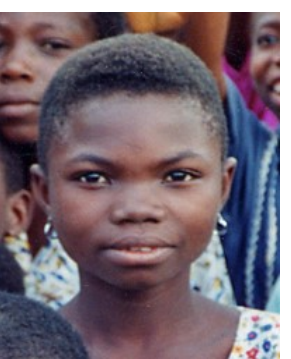
World Popl: 96,900 Total Countries: 2 People Cluster: Guinean Main Language: Lelemi Main Religion: Christianity Status: Significantly reached