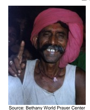
Population: 2,265,000 World Popl: 2,280,000