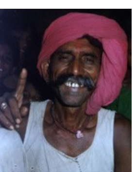
Population: 2,265,000 World Popl: 2,280,000 Total Countries: 2

People Cluster: South Asia Dalit - other