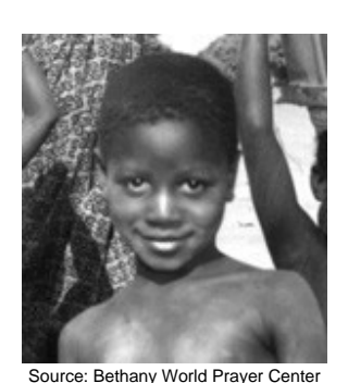
Population: 29,000 World Popl: 29,000 Total Countries: 1 People Cluster: Benue Main Language: C'lela

Main Religion: Ethnic Religions Status: Minimally Reached