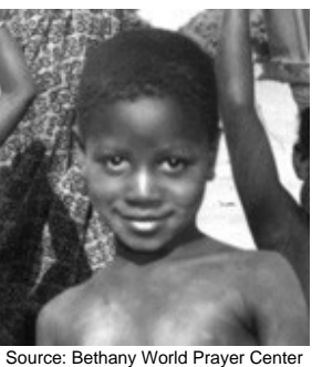
Population: 29,000 World Popl: 29,000 Total Countries: 1 People Cluster: Benue Main Language: C'lela

Main Religion: Ethnic Religions Status: Minimally Reached