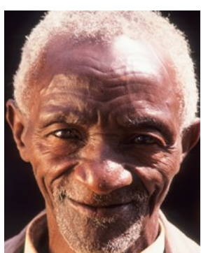
Population: 484,000 World Popl: 484,000 Total Countries: 1

People Cluster: Bantu, Cameroon-Bamileke