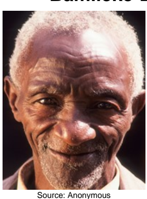
Population: 484,000 World Popl: 484,000