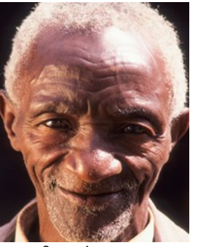
World Popl: 484,000