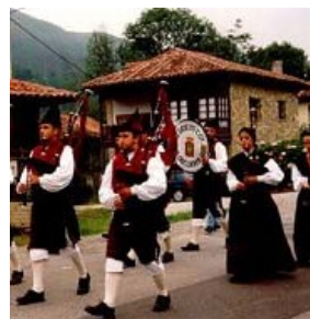
The Mollis

Population: 586,000 World Popl: 595,800 Total Countries: 2 People Cluster: Spanish Main Language: Asturian Main Religion: Christianity Status: ● Superficially reached Evangelicals: 1.0% Chr Adherents: 84.0% Scripture: Complete Bible