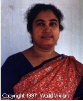
Copyright 1997: World Mission Source: Bethany World Prayer Center

Population: 161,000 World Popl: 170,300 Total Countries: 2 People Cluster: South Asia Tribal - other Main Language: Hindi Main Religion: Hinduism Status: ● Unreached Evangelicals: Unknown % Chr Adherents: 0.15% Scripture: Complete Bible