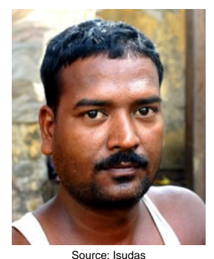
Population: 1,896,000 World Popl: 1,918,400