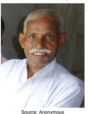
Population: 2,101,000 World Popl: 2,344,500