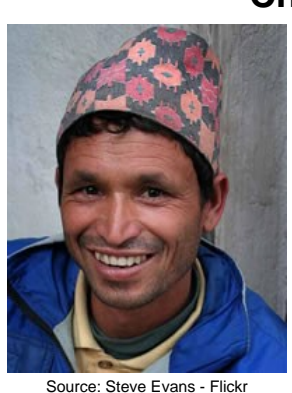
Population: 231,000 World Popl: 5,203,300