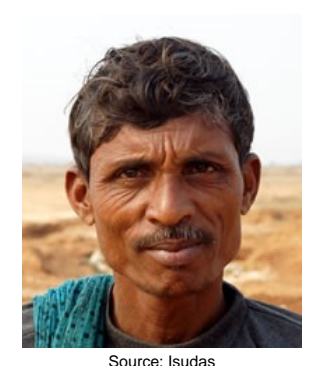
Population: 165,000 World Popl: 165,000