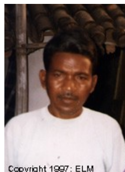
Copyright 1997: ELM Source: Bethany World Prayer Center

Population: 531,000 World Popl: 535,100 Total Countries: 2 People Cluster: South Asia Hindu - other Main Language: Telugu Main Religion: Hinduism Status: ■ Unreached Evangelicals: Unknown % Chr Adherents: 1.07% Scripture: Complete Bible