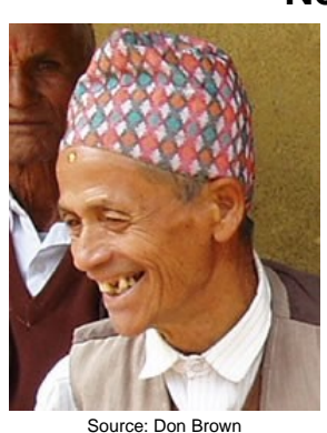
Population: 198,000 World Popl: 1,753,700