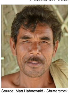
Population: 1,649,000 World Popl: 1,906,200