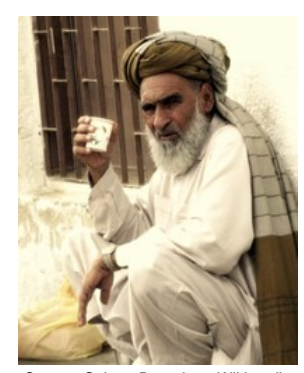
Population: 9,220,000 World Popl: 9,418,000