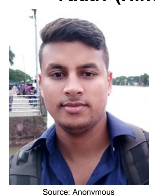
Population: 41,231,000 World Popl: 42,417,400