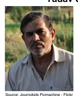
Population: 3,207,000 World Popl: 3,320,000