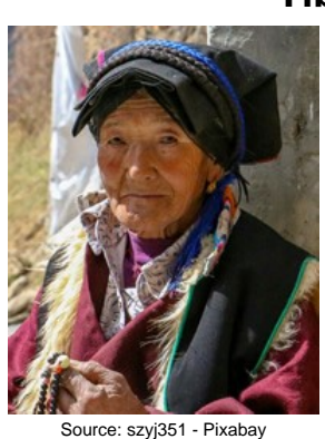
Population: 119,000 World Popl: 1,134,000 Total Countries: 14 People Cluster: Tibetan

Main Language: Tibetan, Central Main Religion: Buddhism Status: • Unreached