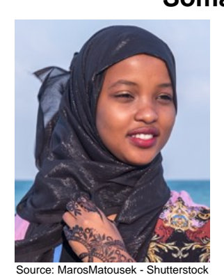
Total Countries: 29 People Cluster: Somali Main Language: Somali Main Religion: Islam