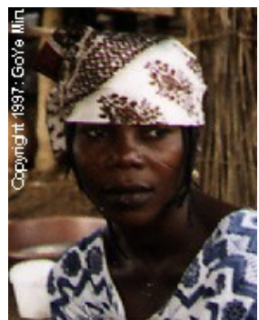
Copyright 1997, GoYe Ministries