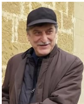
Durdum - Durdum

Population: 1,700 World Popl: 568,700 Total Countries: 6 People Cluster: Altaic Main Language: Kumyk Main Religion: Islam Status: ☀ Frontier Unreached Evangelicals: 0.00% Chr Adherents: 0.00% Scripture: New Testament