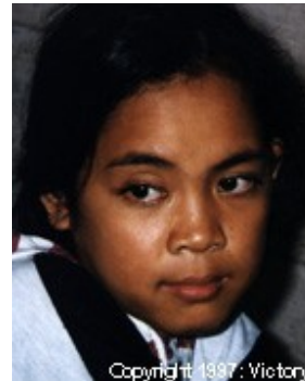
Copyright 1997: Victory Source: Bethany World Prayer Center

Population: 71,000 World Popl: 71,000 Total Countries: 1 People Cluster: Melayu of Sumatra Main Language: Col Main Religion: Islam Status: ★ Frontier Unreached Evangelicals: 0.00% Chr Adherents: 0.00% Scripture: Portions