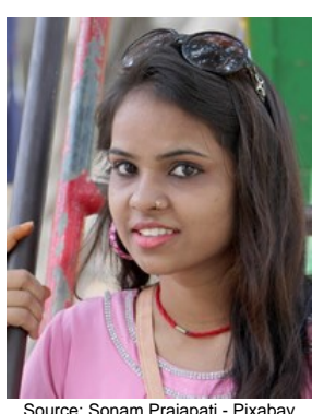
Population: 17,000 World Popl: 2,797,100