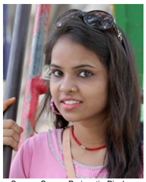
Population: 157,000 World Popl: 2,797,100 Total Countries: 17