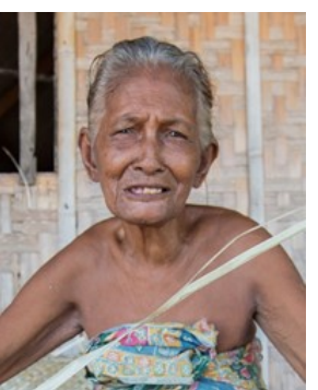
Population: 173,000 World Popl: 173,000 Total Countries: 1

People Cluster: Tukangbesi of Sulawesi Main Language: Tukang Besi North