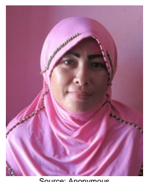
Population: 2,400 World Popl: 2,400 Total Countries: 1