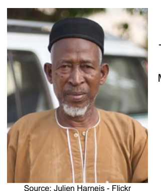
Population: 2,585,000 World Popl: 2,857,600 Total Countries: 5 People Cluster: Susu Main Language: Susu Main Religion: Islam