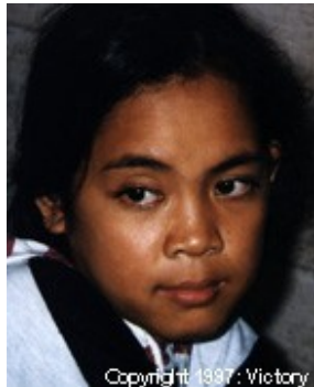
Copyright 1997: Victory Source: Bethany World Prayer Center

Population: 71,000 World Popl: 71,000 Total Countries: 1 People Cluster: Melayu of Sumatra Main Language: Col Main Religion: Islam Status: ☀ Frontier Unreached Evangelicals: 0.00% Chr Adherents: 0.00% Scripture: Portions