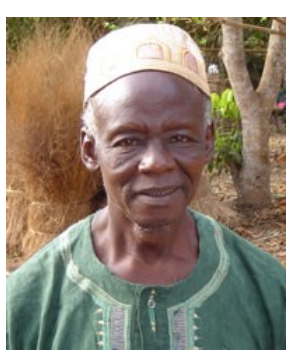
Population: 22,000 World Popl: 44,600 Total Countries: 3 People Cluster: Atlantic Main Language: Oniyan

Main Religion: Ethnic Religions Status: Minimally Reached