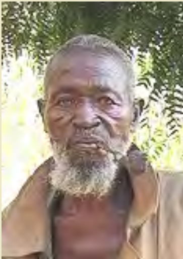
Dogon village elder by Erwin Bolwidt cropped CC

Approximately 800,000 Dogons live in a dry remote savannah area in Mali, spilling over into Burkina Faso. About 20 different languages are spoken in different communities. Unless they learn the language spoken by a neighbor they would not understand each other even though they all identify themselves ethnically as Dogon. The Tombo are one of these.