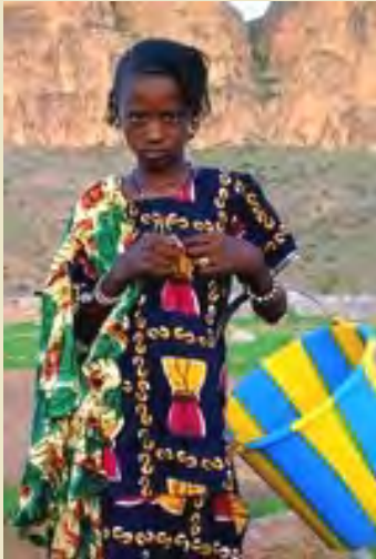
Humburi girl

Humburi Songhay are one of several Songhay people groups living in West Africa. They speak Humburi Senni, which is sometimes called Central Songhay.