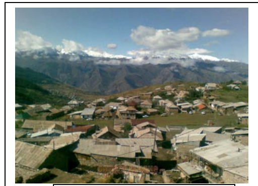
VILLAGE OF TLONDADA -- Bagvalal Language Region