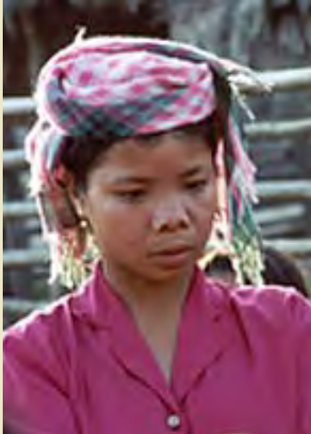
Peoples of Laos, Paul Hattaway © photo used with permission

The Lamet people live in northwestern Laos with just a few, perhaps 200, who live across the border in Thailand where they are known as Khamet.