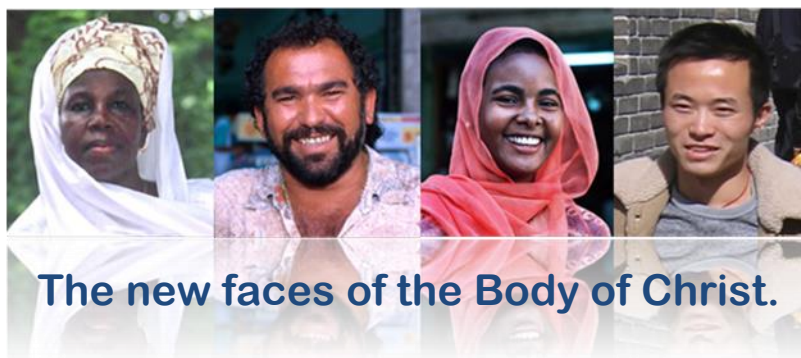
The new faces of the Body of Christ.