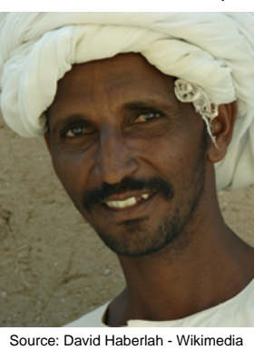
Population: 19,000 World Popl: 18,598,800