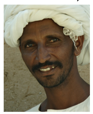
Population: 35,000 World Popl: 18,598,800 Total Countries: 19

People Cluster: Arab, Sudan Main Language: Arabic, Sudanese