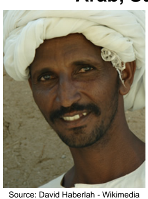
Population: 14,000 World Popl: 18,598,800 Total Countries: 19

People Cluster: Arab, Sudan Main Language: Arabic, Sudanese