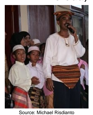
Population: 23,000 World Popl: 23,000 Total Countries: 1