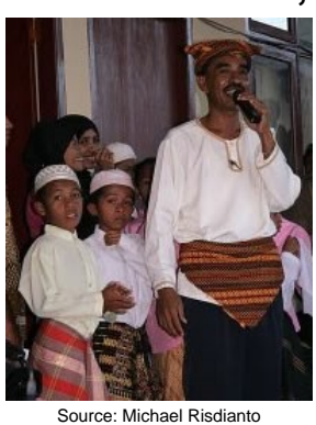
Population: 23,000 World Popl: 23,000 Total Countries: 1