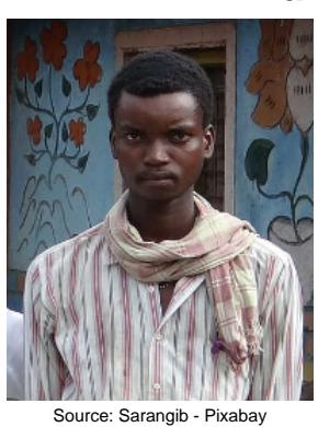
World Popl: 4,800 Total Countries: 1