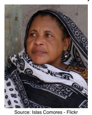
Population: 3,900 World Popl: 371,900