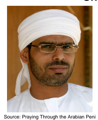
Population: 19,000 World Popl: 36,000 Total Countries: 2

People Cluster: Arab, Arabian Main Language: Arabic, Shihhi