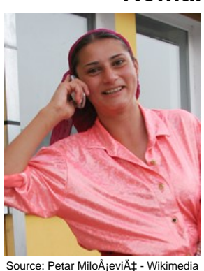
Population: 500 World Popl: 1,880,300 Total Countries: 15 People Cluster: Domari Main Language: Arabic, Gulf Main Religion: Islam

Status: <a>Unreached</a> Evangelicals: 0.20%