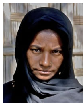
Population: 49,000 World Popl: 2,224,500