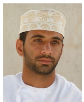
Population: 292,000 World Popl: 2.823,200 Total Countries: 10