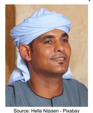
Population: 1,099,000 World Popl: 7,157,400