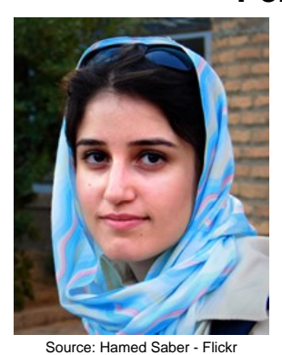
Population: 304,000 World Popl: 46,396,400

Total Countries: 42 People Cluster: Persian Main Language: Persian, Iranian