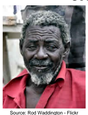
Population: 15,000 World Popl: 143,000 Total Countries: 2

People Cluster: Arab, Arabian Main Language: Soqotri Main Religion: Islam