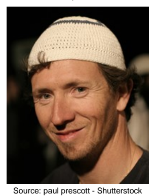
Population: 41,000 World Popl: 784,500 Total Countries: 12 People Cluster: Jewish

Main Language: Yiddish, Eastern Main Religion: Ethnic Religions Status: Unreached Evangelicals: 1 50%