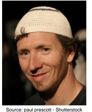
Population: 1,600 World Popl: 784,500 Total Countries: 12 People Cluster: Jewish

Main Language: Yiddish, Eastern Main Religion: Ethnic Religions Status: ★ Frontier Unreached