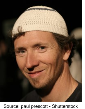
Population: 1,900 World Popl: 784,500 Total Countries: 12 People Cluster: Jewish

Main Language: Yiddish, Eastern Main Religion: Ethnic Religions Status: ★ Frontier Unreached