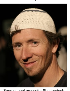
Population: 188,000 World Popl: 784,500 Total Countries: 12 People Cluster: Jewish

Main Language: Yiddish, Eastern Main Religion: Ethnic Religions Status: ★ Frontier Unreached