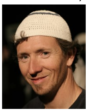
Population: 1,900 World Popl: 784,500 Total Countries: 12 People Cluster: Jewish

Main Language: Yiddish, Eastern Main Religion: Ethnic Religions Status: ★ Frontier Unreached